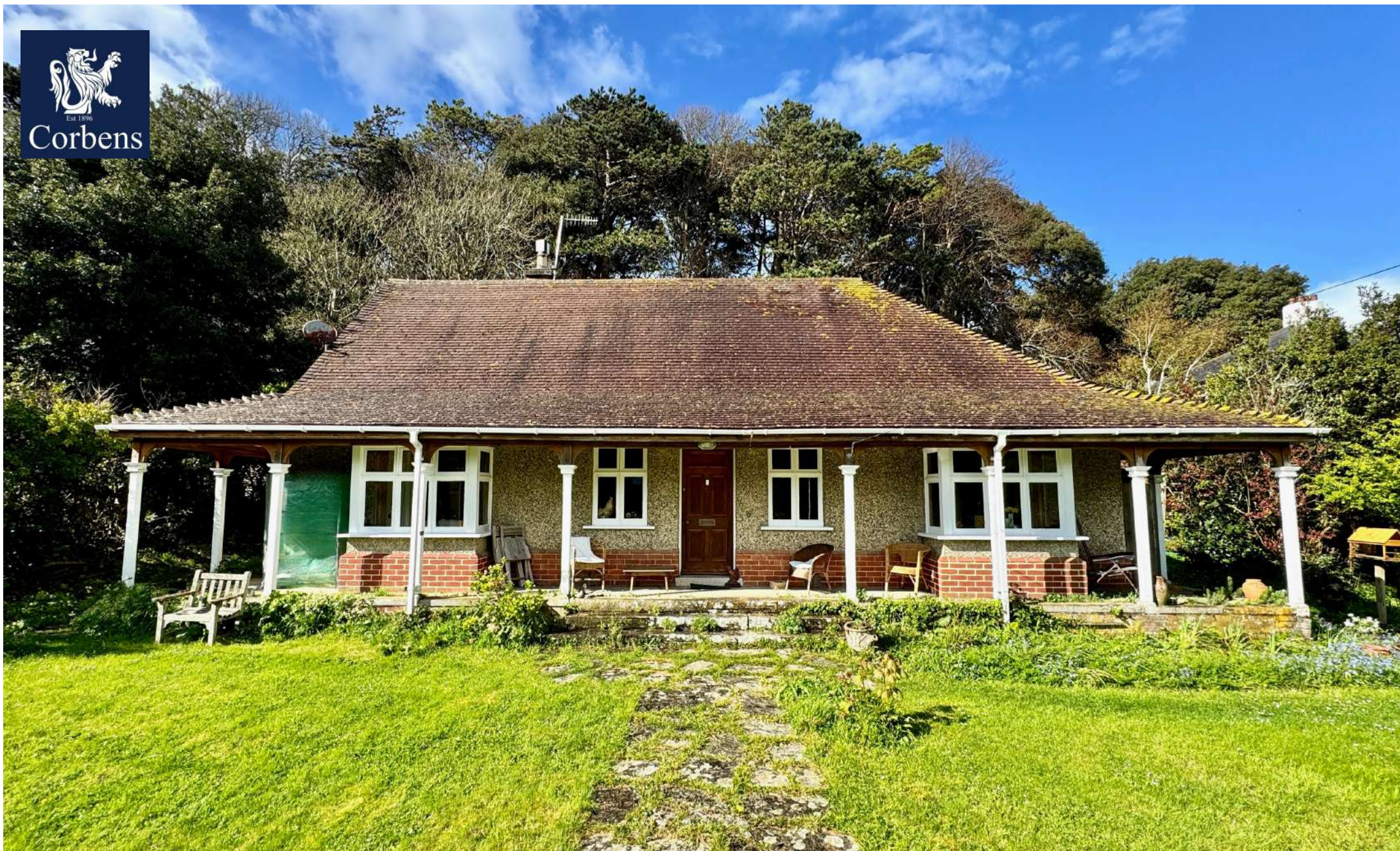
GLENILEX, 6 SUNNYDALE ROAD, SWANAGE £749,950 Freehold