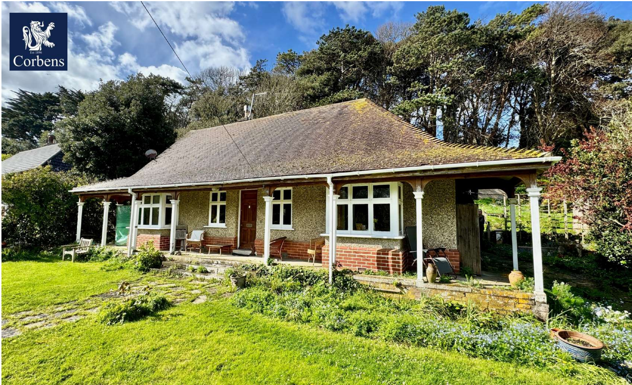
GLENILEX, 6 SUNNYDALE ROAD, SWANAGE £795,000 Freehold