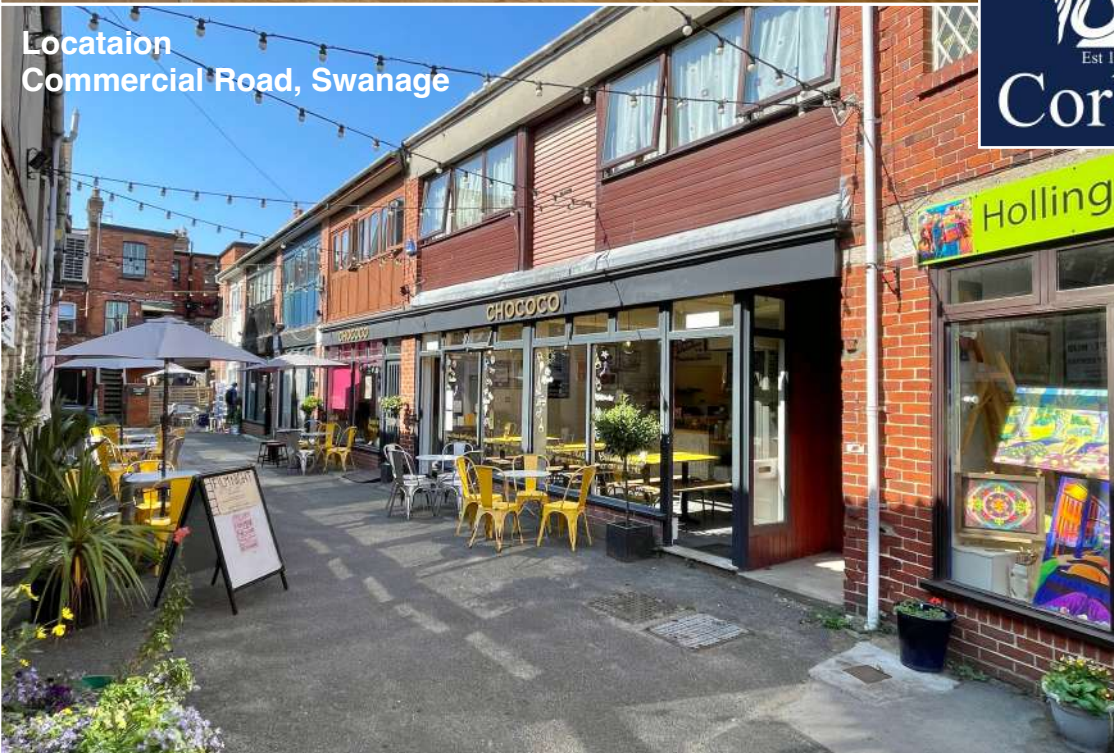
Location Commercial Road, Swanage