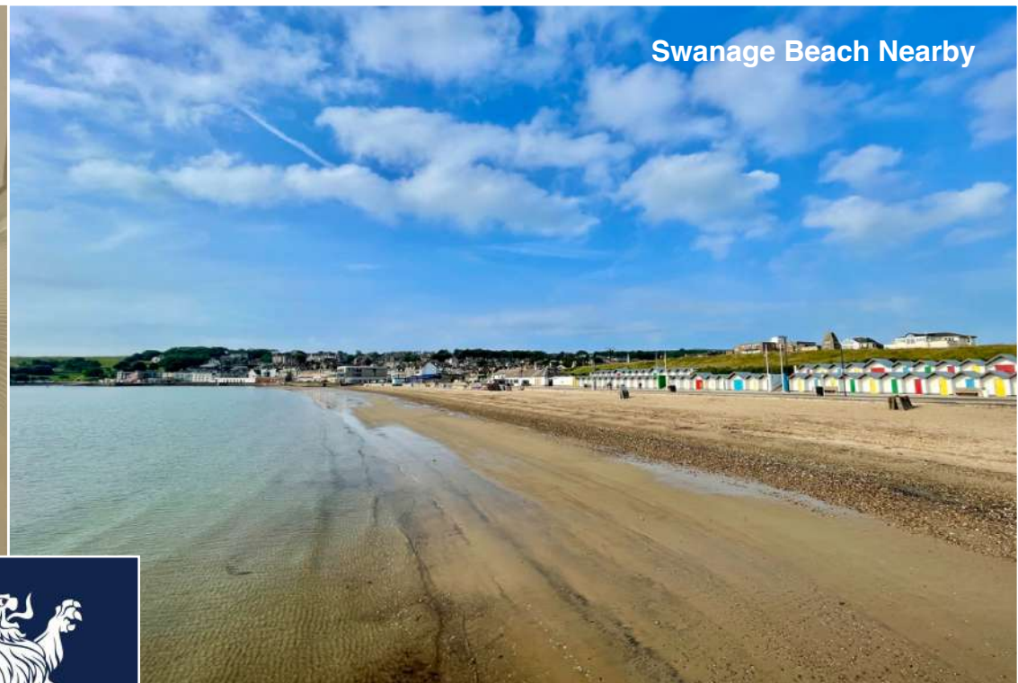
Swanage Beach Nearby