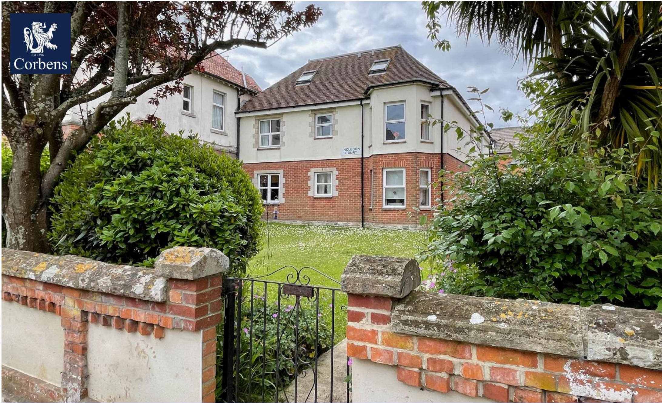
FLAT 2 INCLEDON COURT, CRANBORNE ROAD, SWANAGE £159,950 Shared Freehold