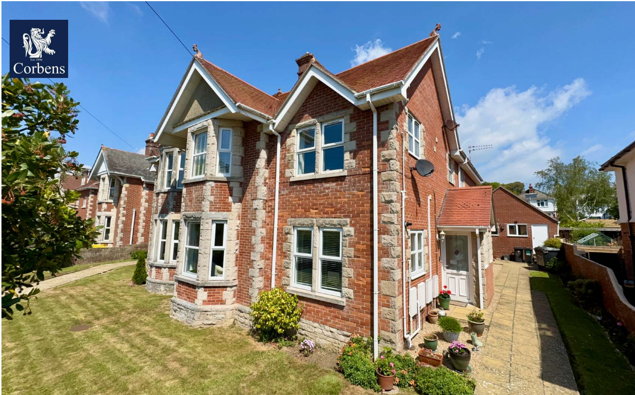
APARTMENT 4, 44 VICTORIA AVENUE, SWANAGE £365,000 Leasehold