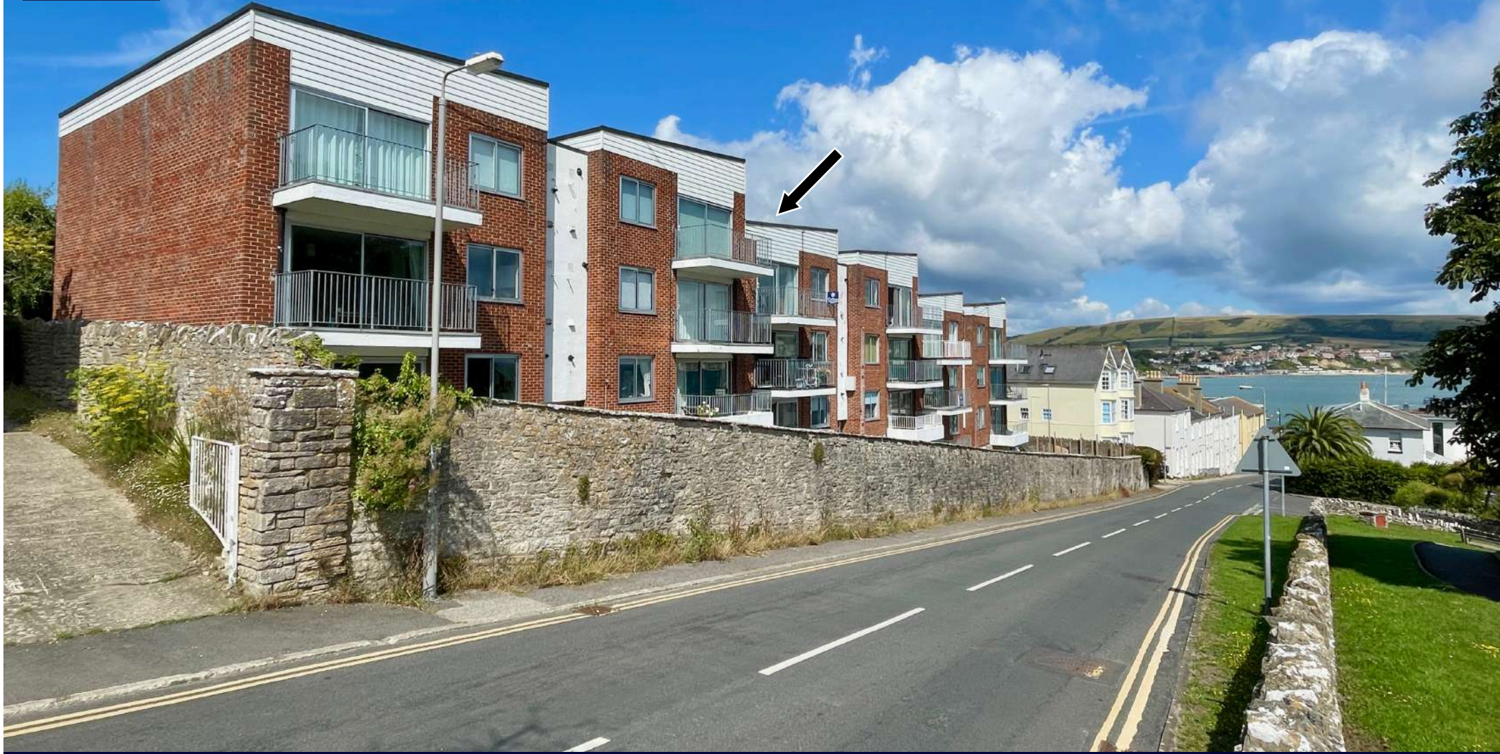
23 PEVERIL HEIGHTS, SENTRY ROAD, SWANAGE £365,000 Shared Freehold