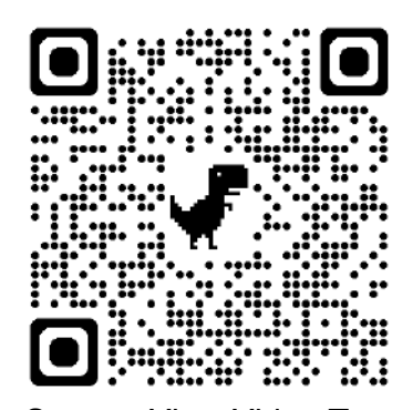
Scan to View Video Tour