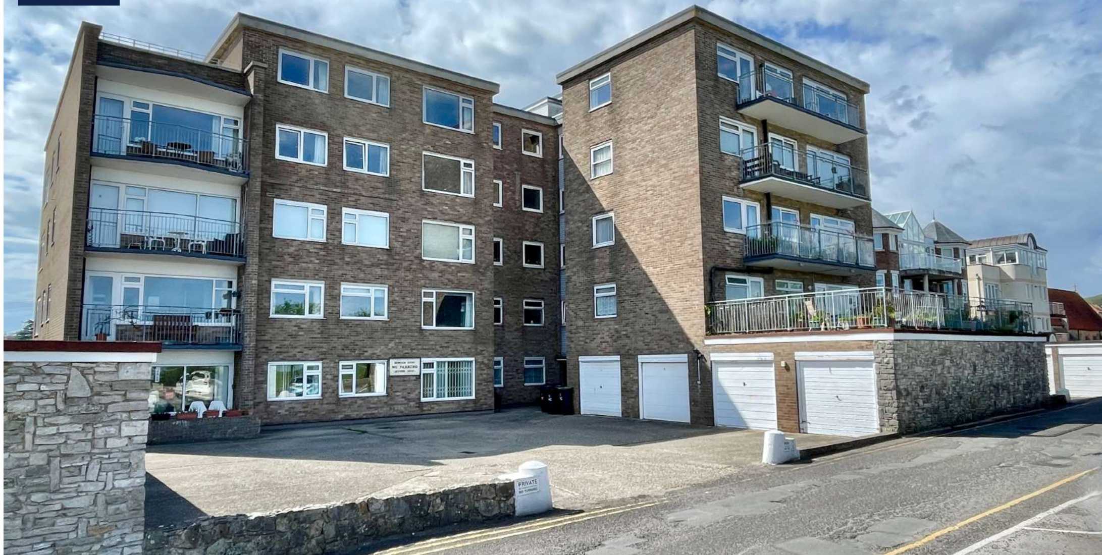
30 MOWLEM COURT, REMPSTONE ROAD, SWANAGE Guide £495,000 Shared Freehold