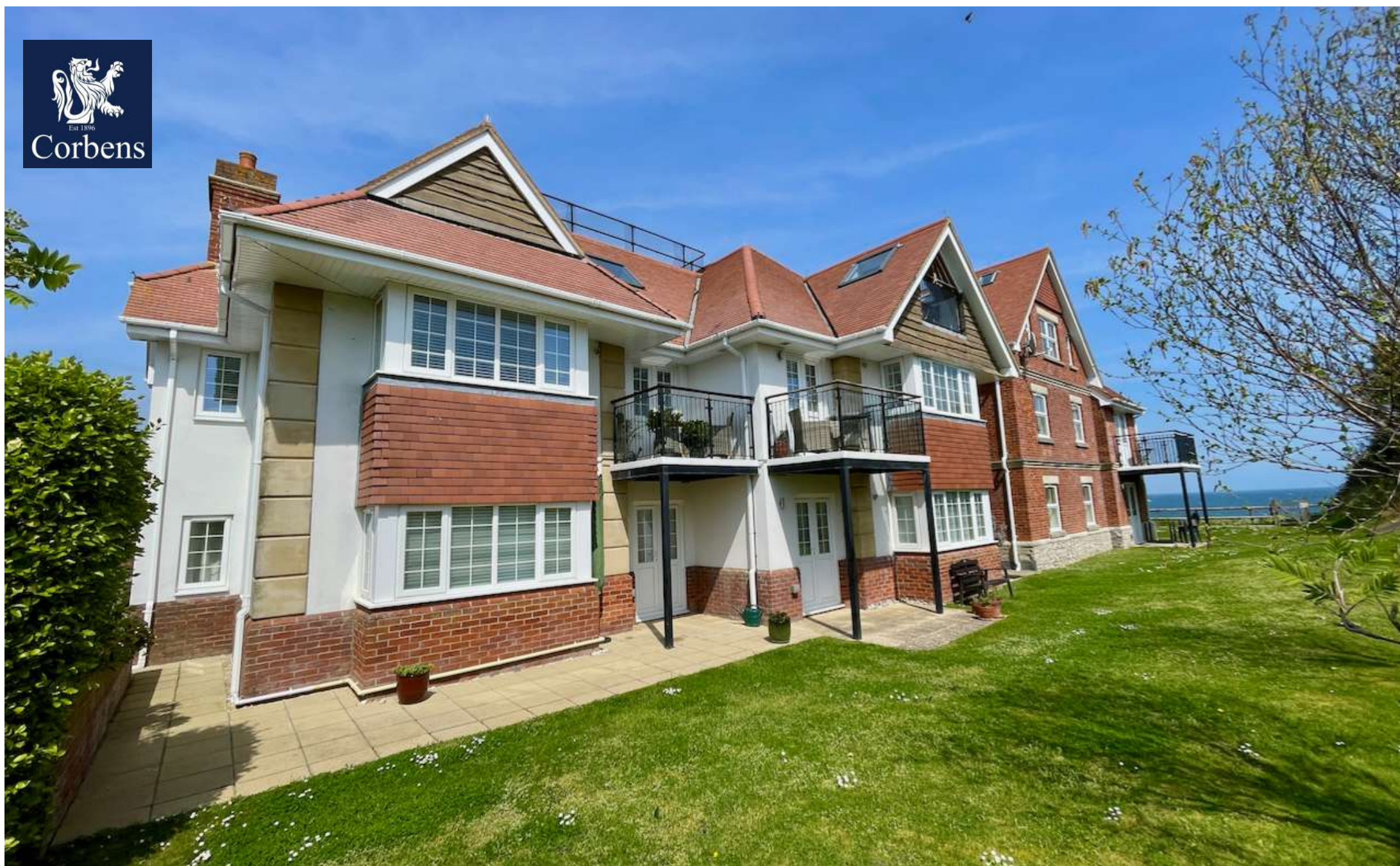
7 THE CLIFFS, BURLINGTON ROAD, SWANAGE £395,000 Leasehold