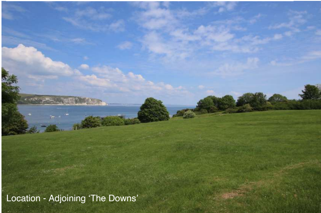
Location - Adjoining 'The Downs'