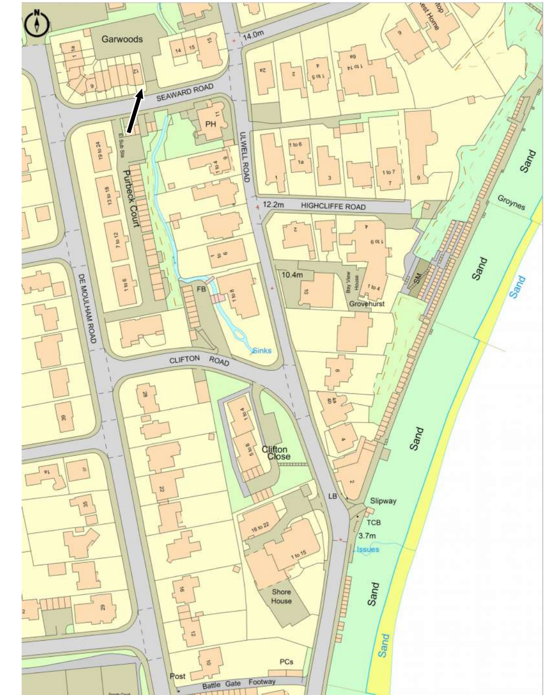
THE PROPERTY MISDESCRIPTION ACT 1991 You are advised to check the availability of this property before travelling any distance to view. The Agent has not tested any apparatus, equipment, fixtures and fittings or services and so cannot verify that they are in working order or fit for the purpose. References to the Tenure of a Property are based on information supplied by the Seller. The area of the building is given for guidance purposes only and must be verified by the purchasers surveyor. A Buyer is advised to obtain verification of this information from their Solicitor and/or Surveyor. FLOOR PLANS The floor plans supplied are for guidance purposes only and are reproduced from the Ordnance Surveyor and appear on the plans. LOCATION PLAN The location plans supplied are for identification purposes only and are reproduced from the Ordnance Survey Map with permission of the Controller of H.M. Stationery Office. Crown Copyright reserved.