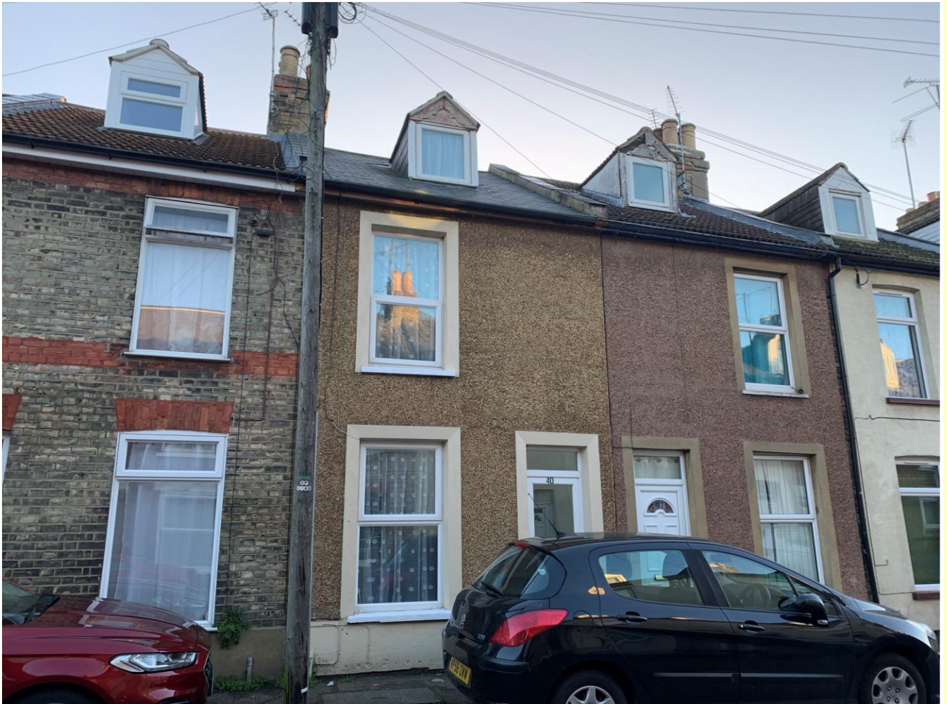
40 Birchwood Street | King's Lynn