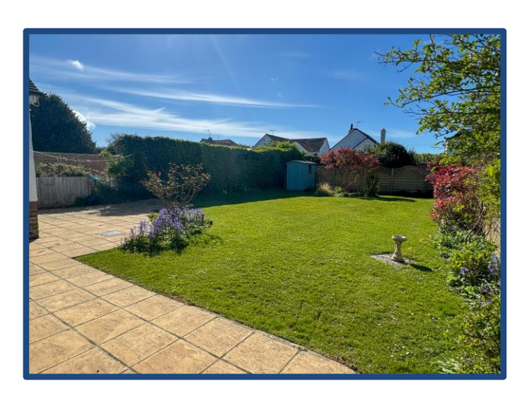
More photographs may be available on our website www.maysagents.co.uk

The mention of any appliance and/or services in these sales particulars does not imply that they are in full and efficient working order or that they have been tested.