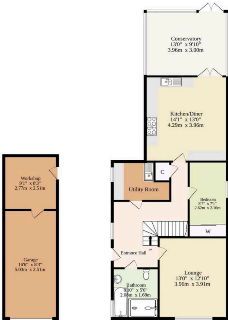
Ground Floor 1010 sq.ft. (93.8 sq.m.) approx.