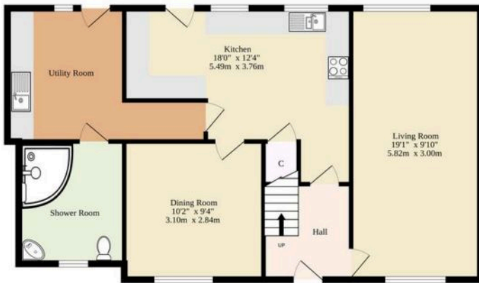
Ground Floor 684 sq.ft. (63.5 sq.m.) approx.