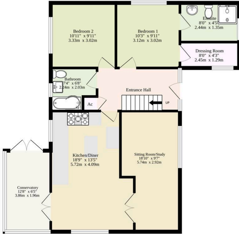
Ground Floor 908 sq.ft. (84.4 sq.m.) approx.