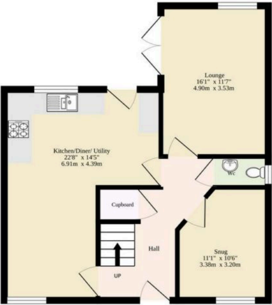
Ground Floor 637 sq.ft. (59.2 sq.m.) approx.