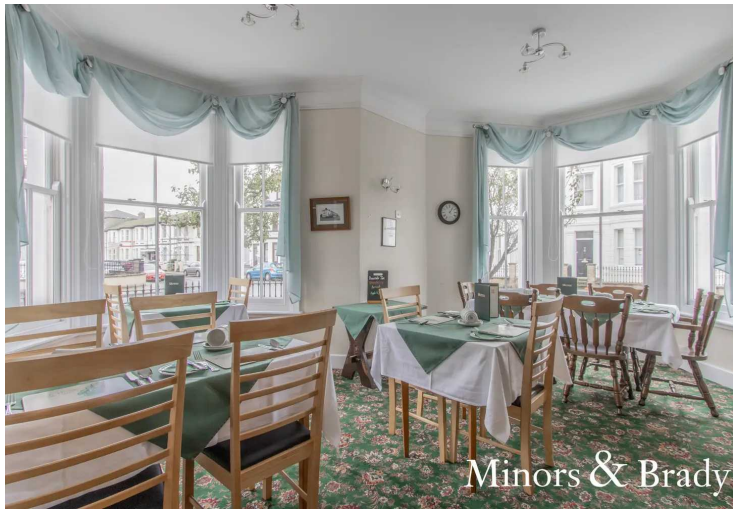
Minors & Brady