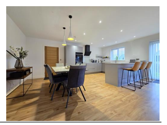
5 ATLANTA VIEW, WESTWARD HO! EX39 1WG GUIDE £595,000

A superb 3 double bedroom modern detached bungalow situated within walking distance of the beach, village amenities offering contemporary open concept living with stylishly appointed en-suite & shower room together with good sized enclosed garden, garage & driveway parking.