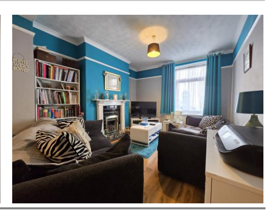
21 MILTON PLACE, BIDEFORD, EX39 3BN