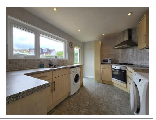
10 BALLARDS CRESCENT, WEST YELLAND, EX31 3EU £275,000

A 2 double bedroom detached bungalow betwixt the villages of Fremington & Instow offering well maintained accommodation benefiting from uPVC double glazing & gas fired central heating together with enclosed gardens, garage and driveway parking. Ready for immediate occupation - no onward chain.