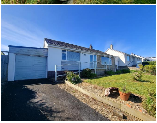
Approx. 85.3 sq. metres (918.0 sq. feet)