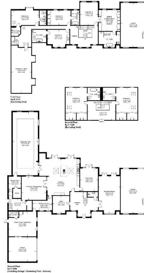
Illustration for identification purposes only, measurements are approximate, not to scale. FloorplansUsketch.com © 2019 (ID538733)

Approximate Gross Internal Area Total = 1012.3 sq m / 10897 sq ft (Including Garage / Annex / Swimming Pool / Excluding Void)