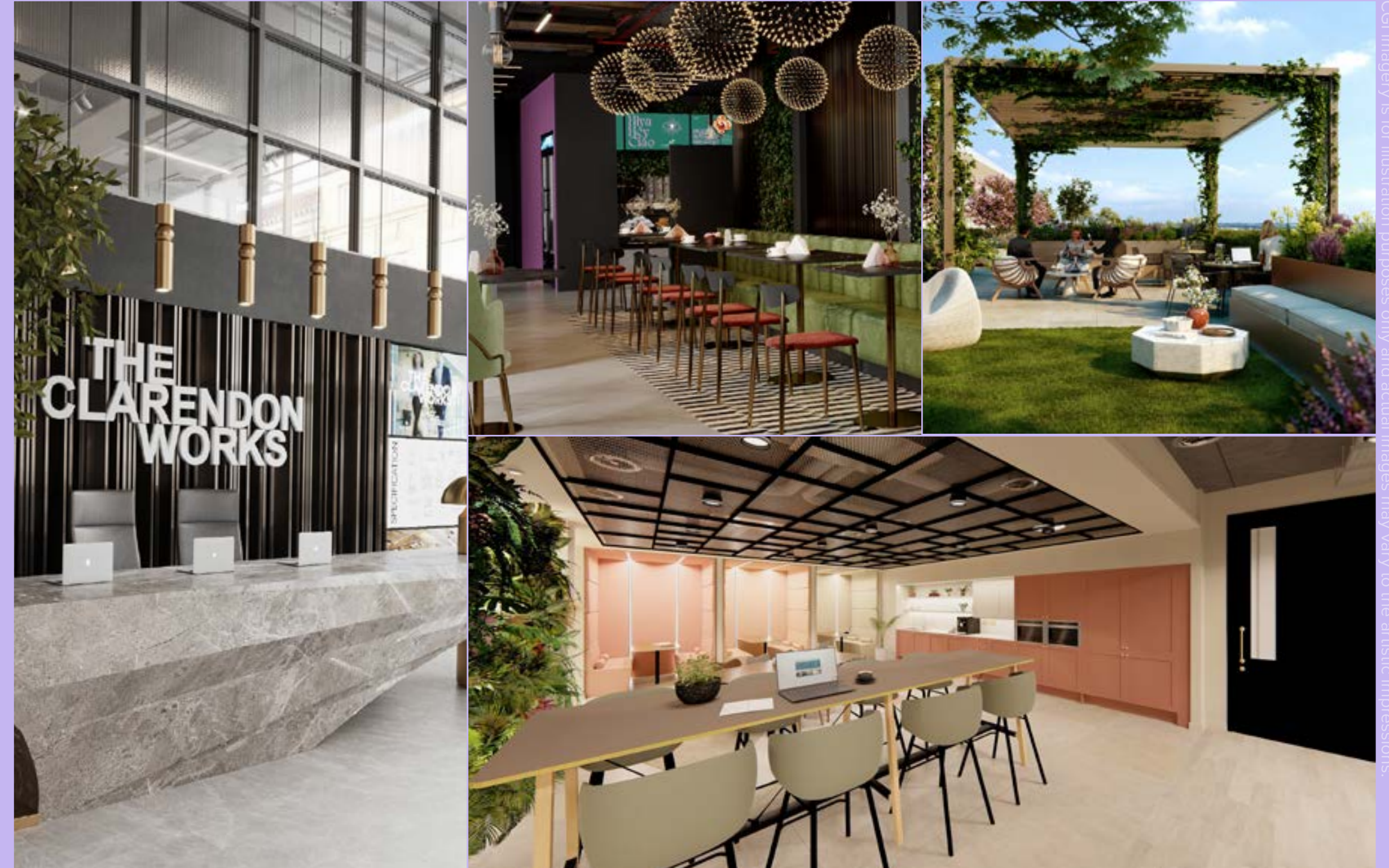
CGI Imagery is for illustration purposes only and actual images may vary to the artistic impressions.

With events to foster community, amenities to empower and Concierge teams to facilitate, our Residents and their businesses are at the core of our brand.