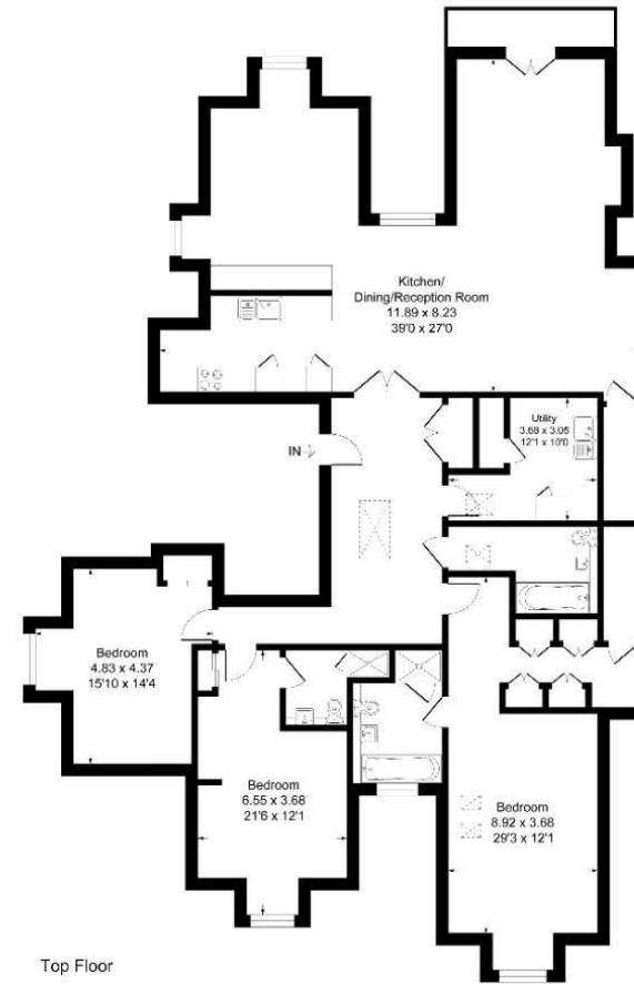
Top Floor Illustration for identification purposes only, measurements are approximate, not to scale.

Oakfield House GU22 Approximate Gross Internal Floor Area = 204 sq m / 2200 sq ft