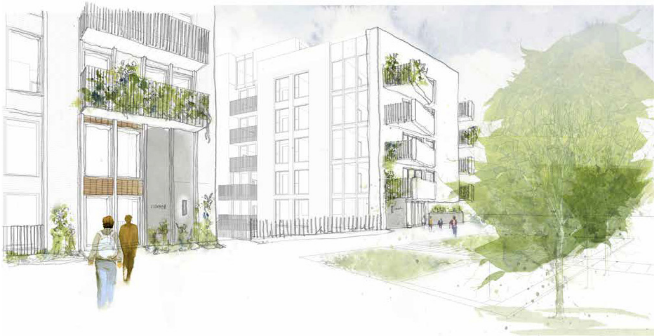
Middle Yard comes with a 10 Year Global Homes Warranty with proposed completion set for February 2022.

You will not be charged interest on the 40% loan for the first 5 years of owning your home. However, a management fee of £1 a month will be applicable from the date of purchase. From year six, a fee of 1.75% is payable on the equity loan, which rises annually by RPI (Retail Price Index) inflation plus 1%. Please call us for more information.