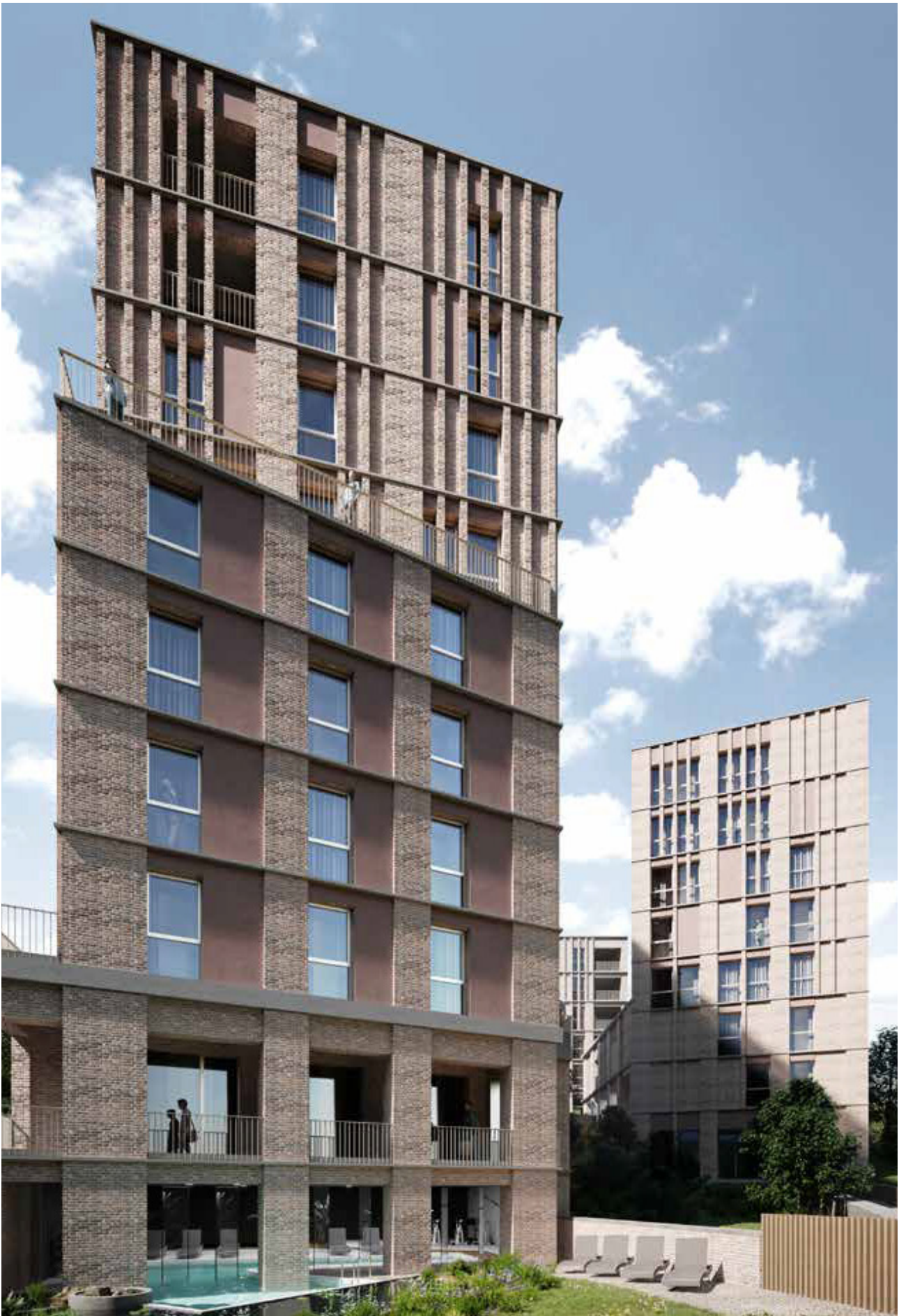
*CGI imagery is indicative and may differ from the final product.