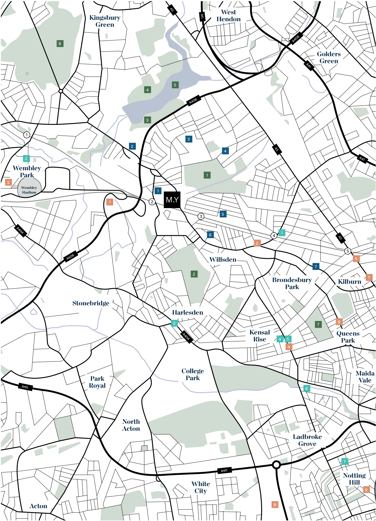
Middle Yard is on the boundary between leafy Dollis Hill and bustling Neasden with its lovely open spaces, including Brent Reservoir and Gladstone park, but it is only 13 minutes from the West End by tube.