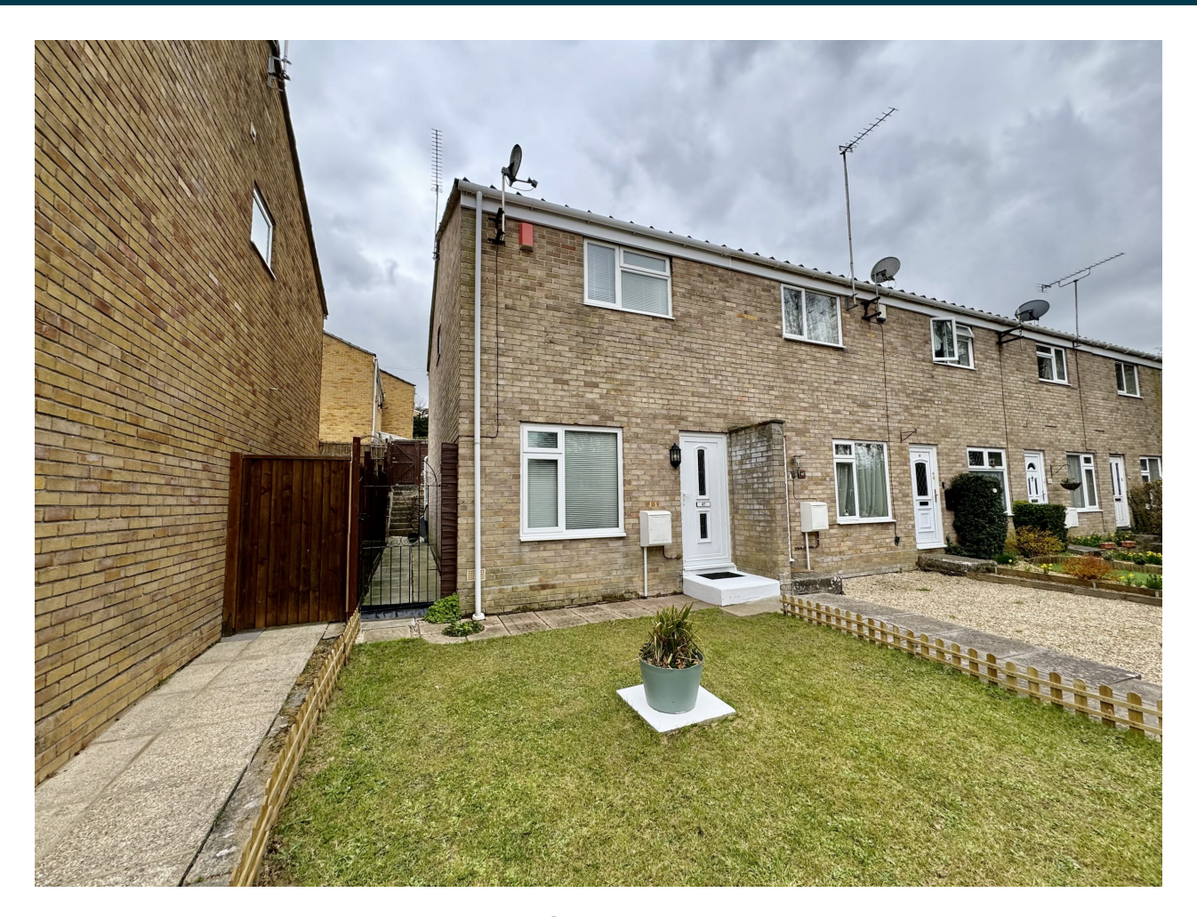
47, Abbots Way, Yeovil, Somerset BA21 3HX £200,000

Towers Wills welcome to the market this well-presented End Terrace property in a popular location. Briefly comprising lounge, kitchen/diner, two bedrooms, bathroom, low maintenance rear garden and garage in a block. Priced for immediate interest and early viewing is advised.