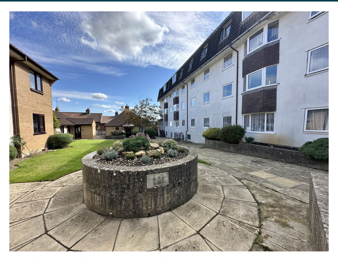
30, Crofton Court, Yeovil, Somerset BA21 4DZ £35,000

Towers Wills welcome to the market this beautifully presented one bedroom apartment, located in the Crofton Court retirement complex for the over 60's and briefly comprises; communal entrance, reception hallway, open plan lounge/diner/kitchen, bedroom and shower room. Conveniently positioned within walking distance to the Yeovil town centre and Yeovil District Hospital, onsite home manager, communal gardens and communal library/lounge. NO ONWARD CHAIN.