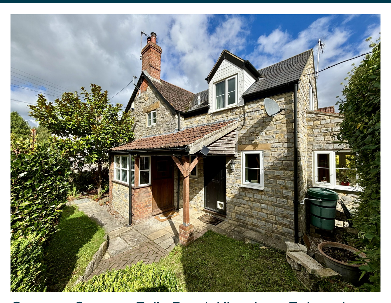
Gummer Cottage, Folly Road, Kingsbury Episcopi, Martock, Somerset TA12 6AT £425,000

Towers Wills are delighted to present this characterful yet spacious cottage benefiting from; a light and airy kitchen/diner/living area, utility, downstairs WC, sitting room with study area, three bedrooms with walk in wardrobe to the master and family bathroom. Outside property has a charming garden, driveway parking and a large garage/workshop. Kingsbury Episcopi was crowned 'Somerset Village of the Year 2018' and offers a range of local facilities including a shop with cafe and Post Office, recreation ground, two churches and a primary school in nearby Stembridge. One not to miss!