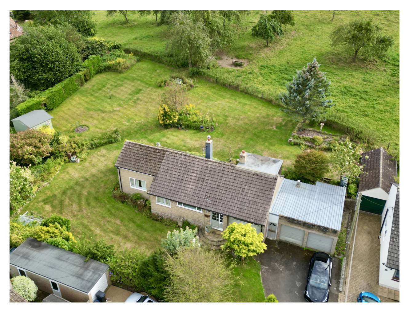
Green Acres, Orchard Close, West Coker, Yeovil, Somerset BA22 9BL