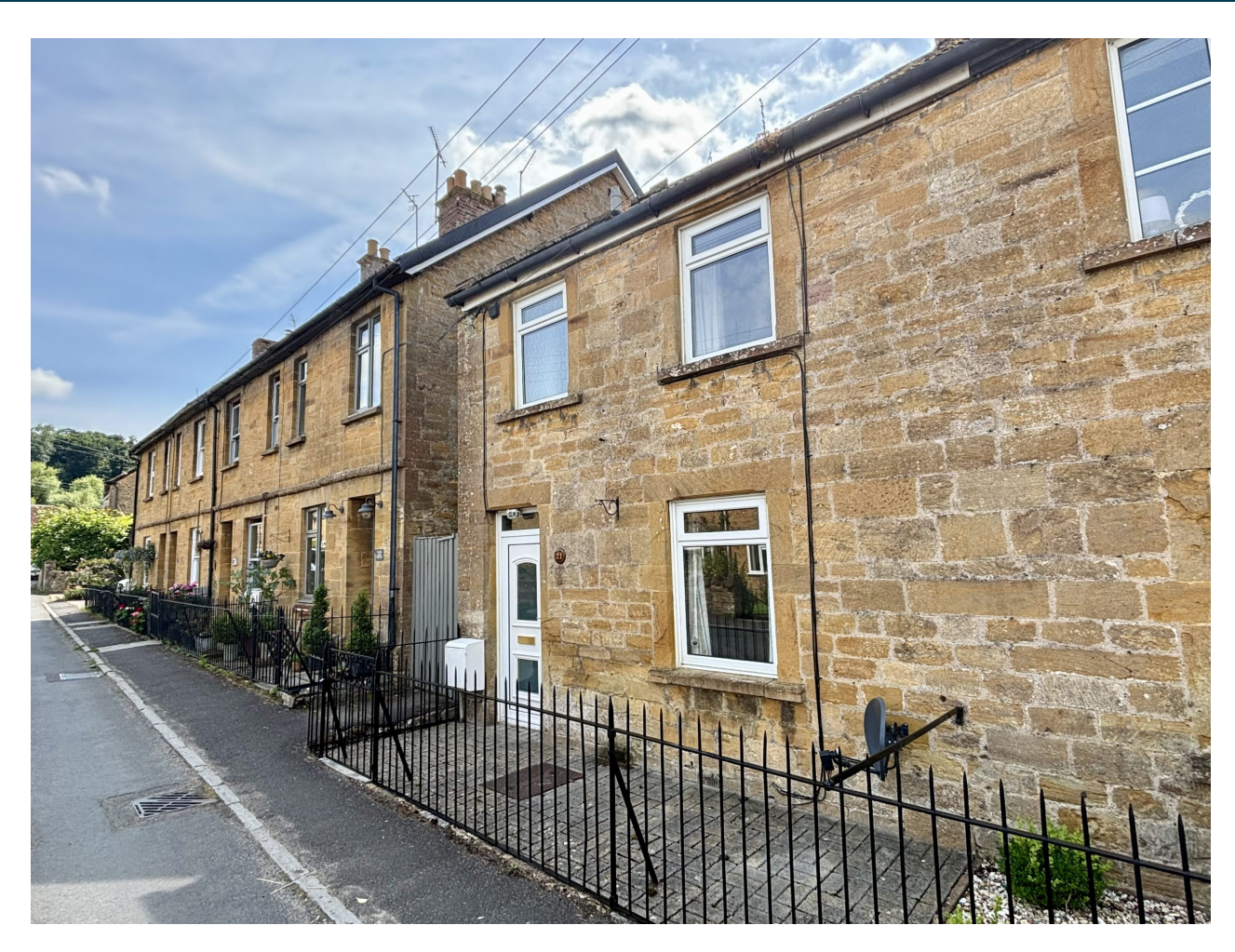
21, Townsend, Montacute, Yeovil, Somerset TA15 6XH