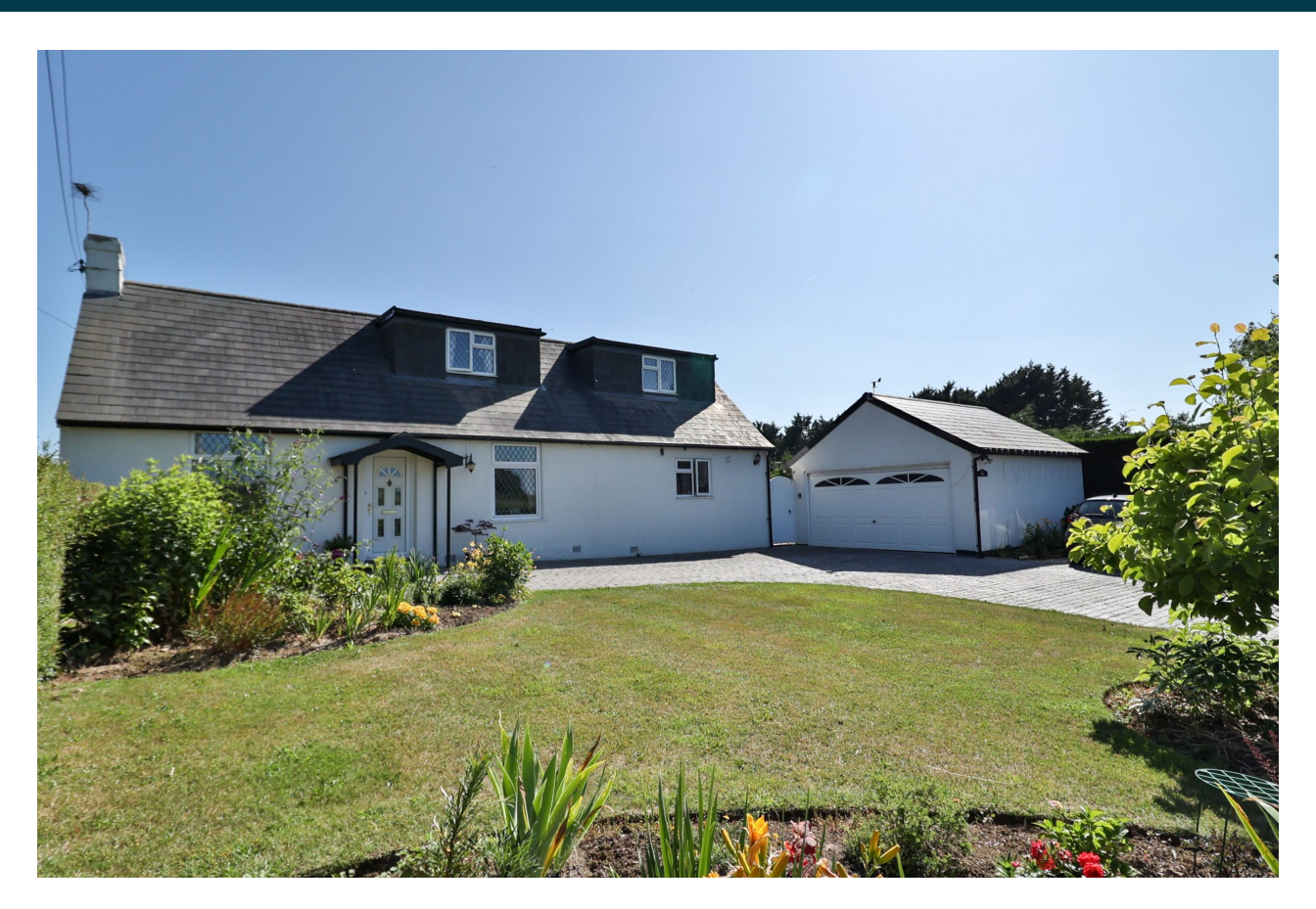
The Laurel, Tintinhull Road, Chilthorne Domer, Yeovil, Somerset BA22 8QU

→ 01935 577 032 | 01460 298 530 | → info@towerswills.co.uk