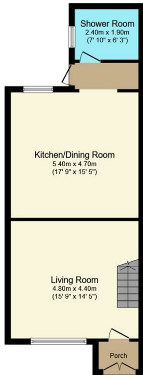
Ground Floor Floor area 53.3 m 2 (574 sq.ft.)