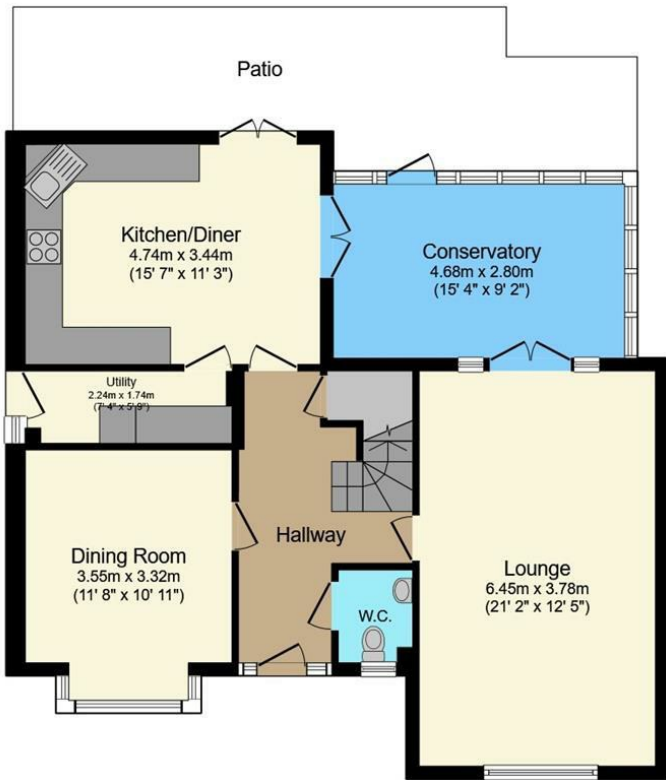
Ground Floor Floor area 109.2 m 2 (1,176 sq.ft.)