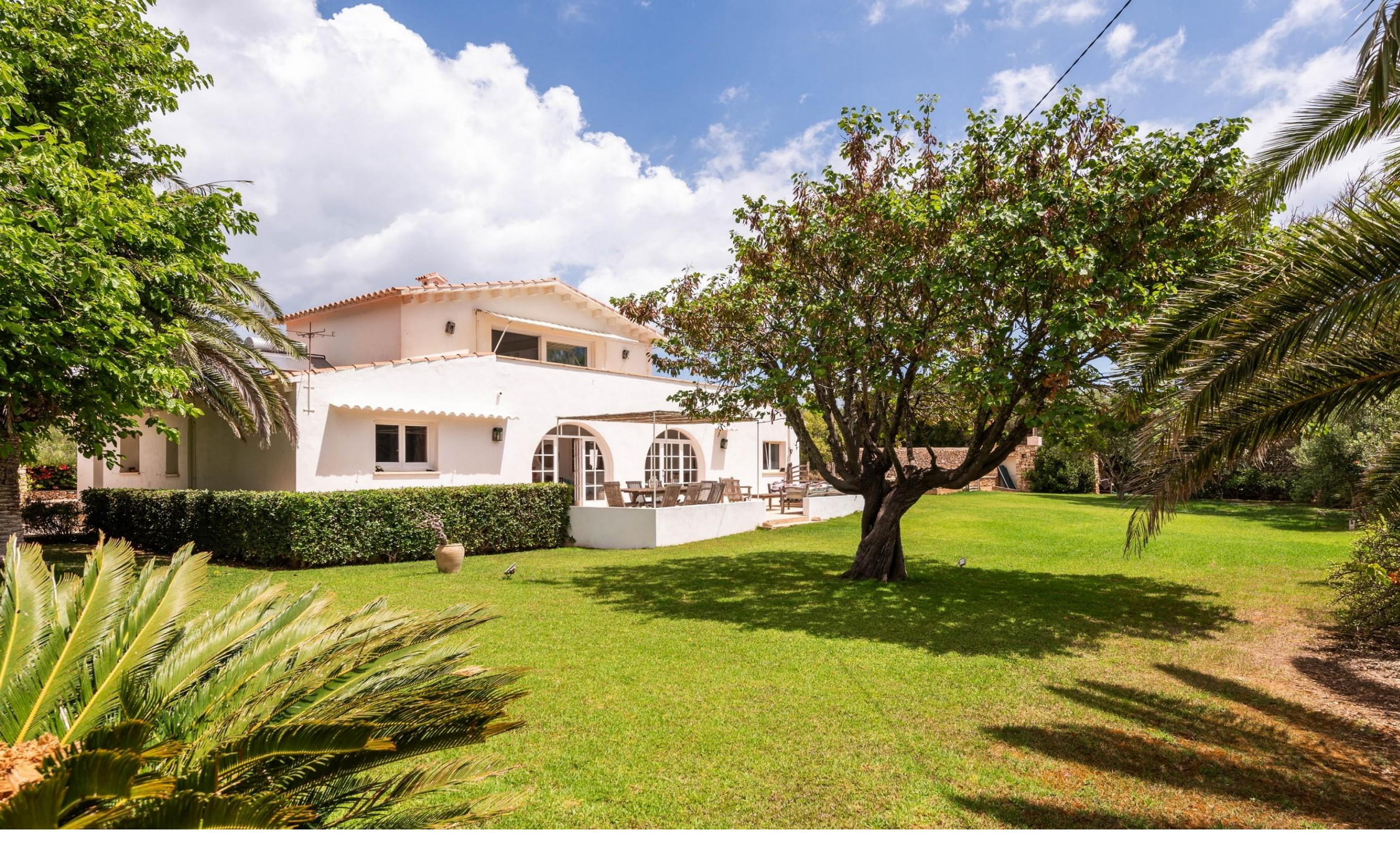
Typical Menorcan property with swimming pool and guest house, San Luis Menorca