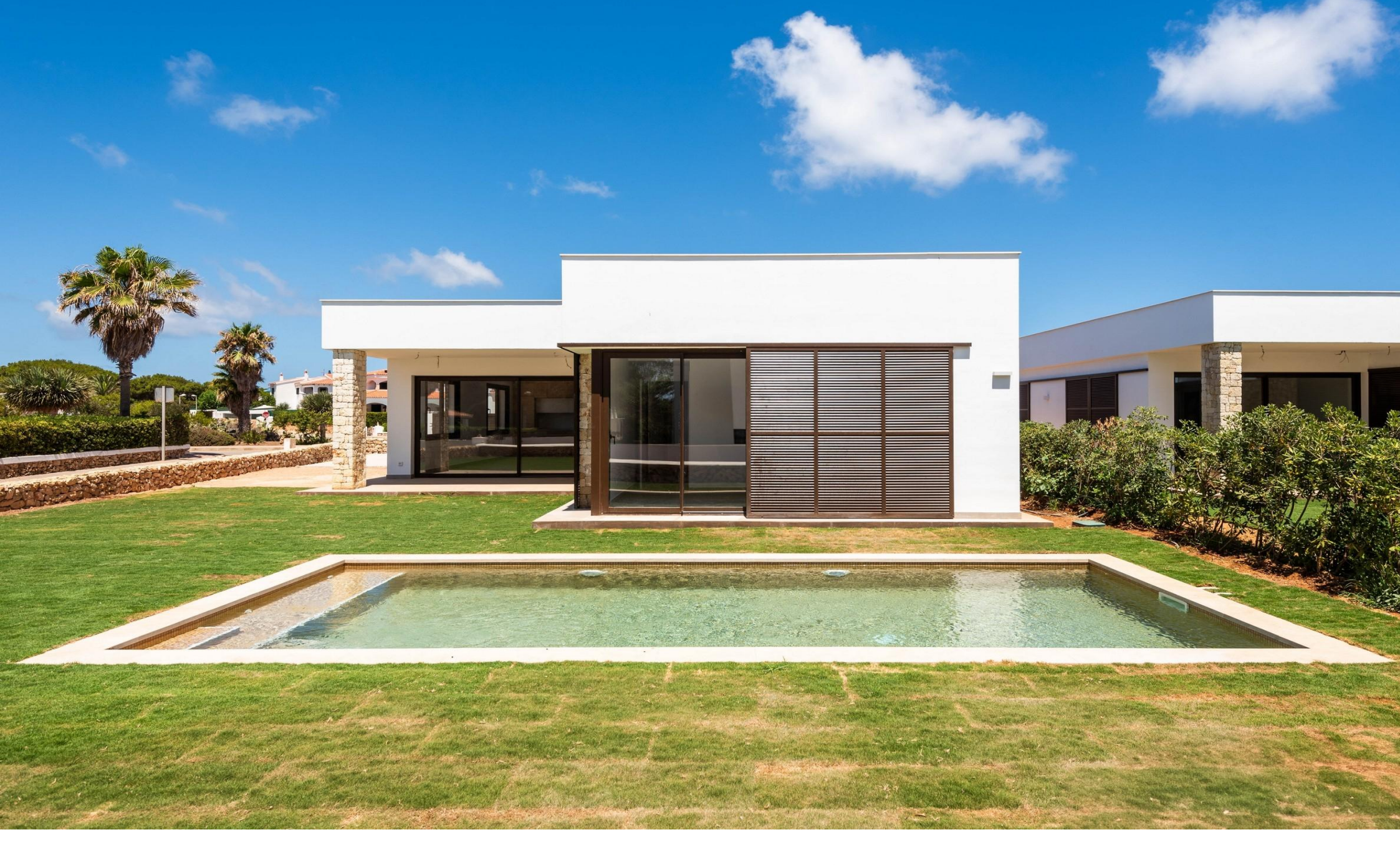
New construction villa, ready to move in, near the beach of S'Arenal d'en Castell Arenal de'n Castell - Menorca - Balearic Islands