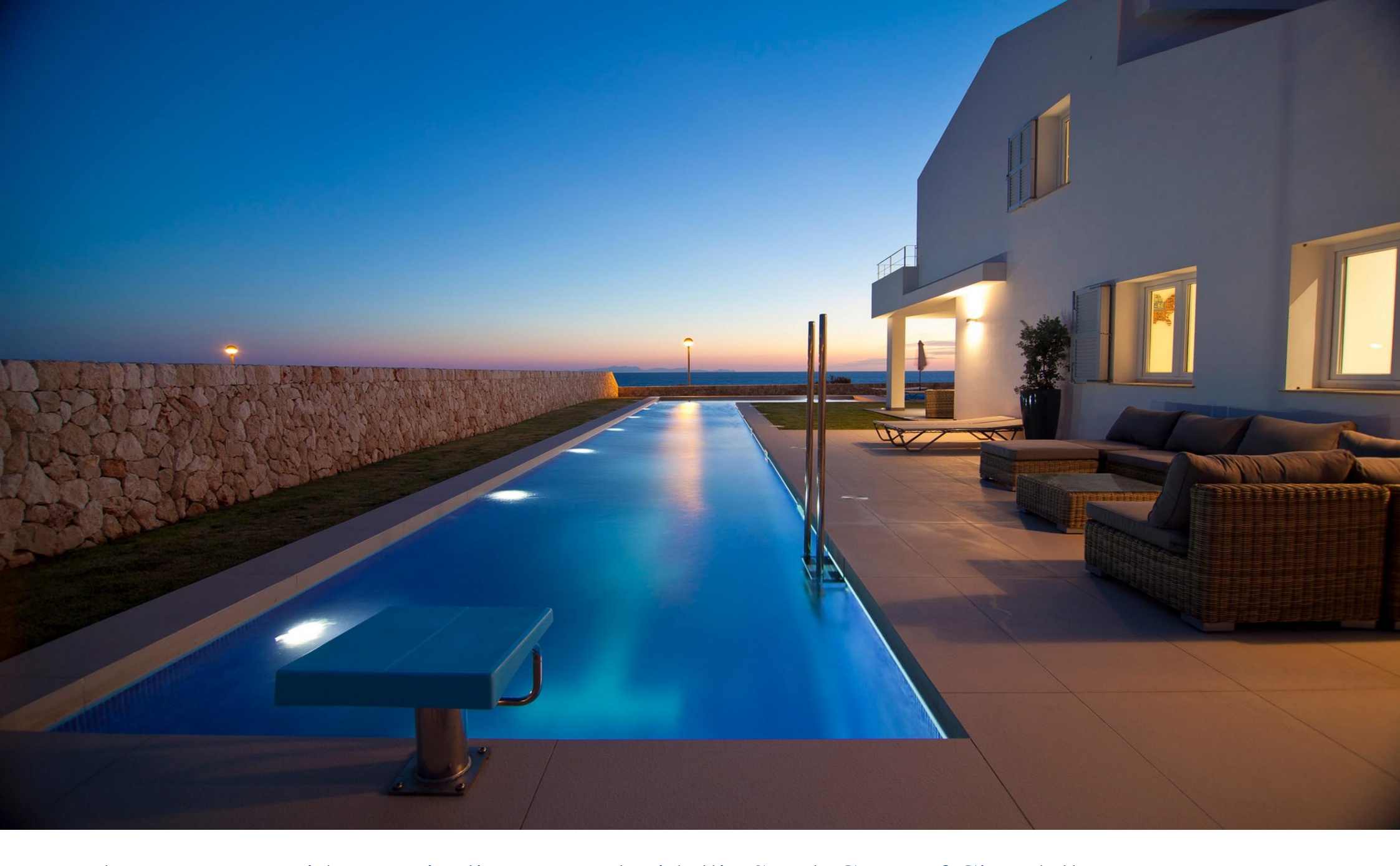
Modern property with a tourist license on the idyllic South Coast of Ciutadella, Menorca Sotheby's Ciutadella - Menorca - Balearic Islands