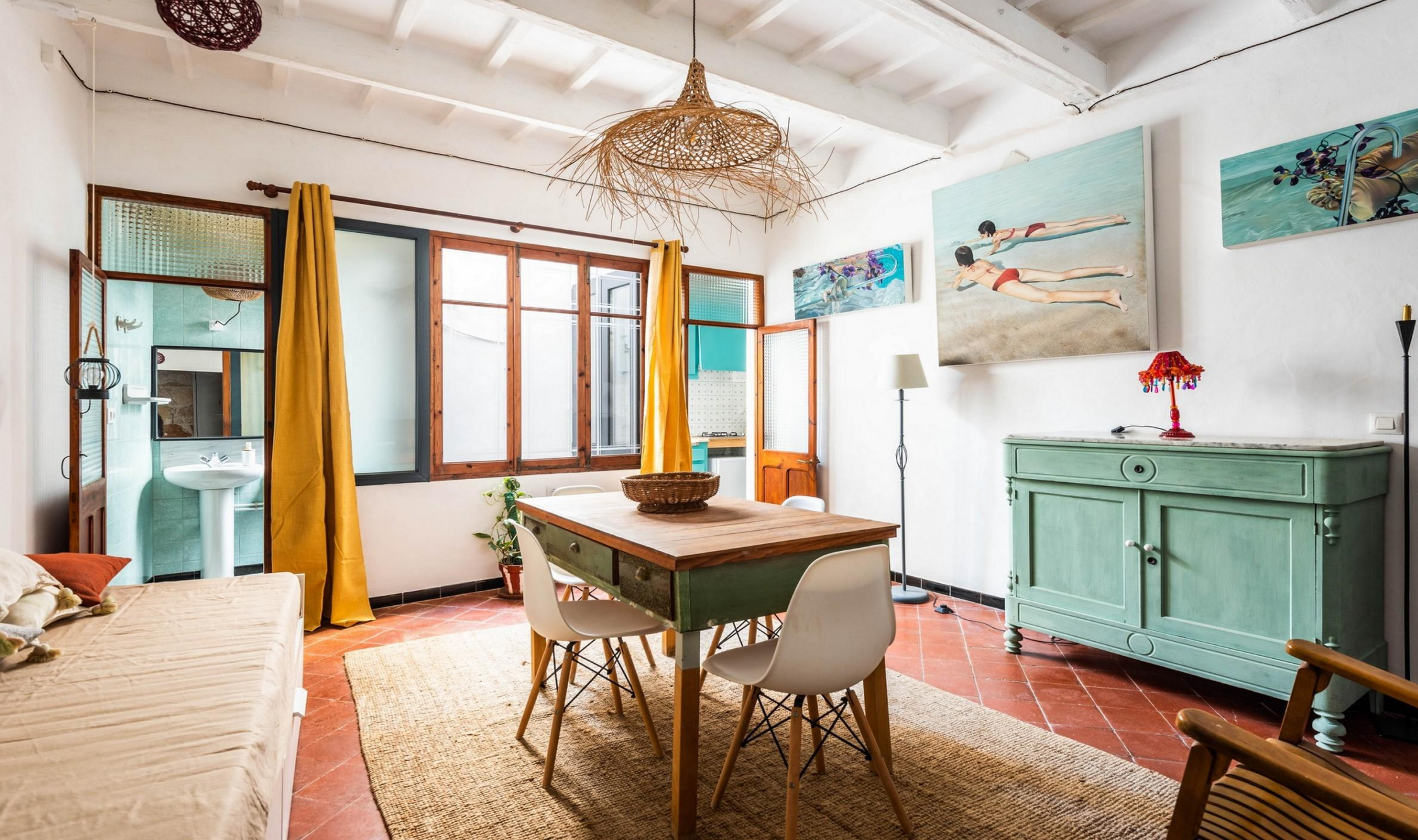
Artist house in the historic center of Ciutadella Ciutadella - Menorca - Balearic Islands