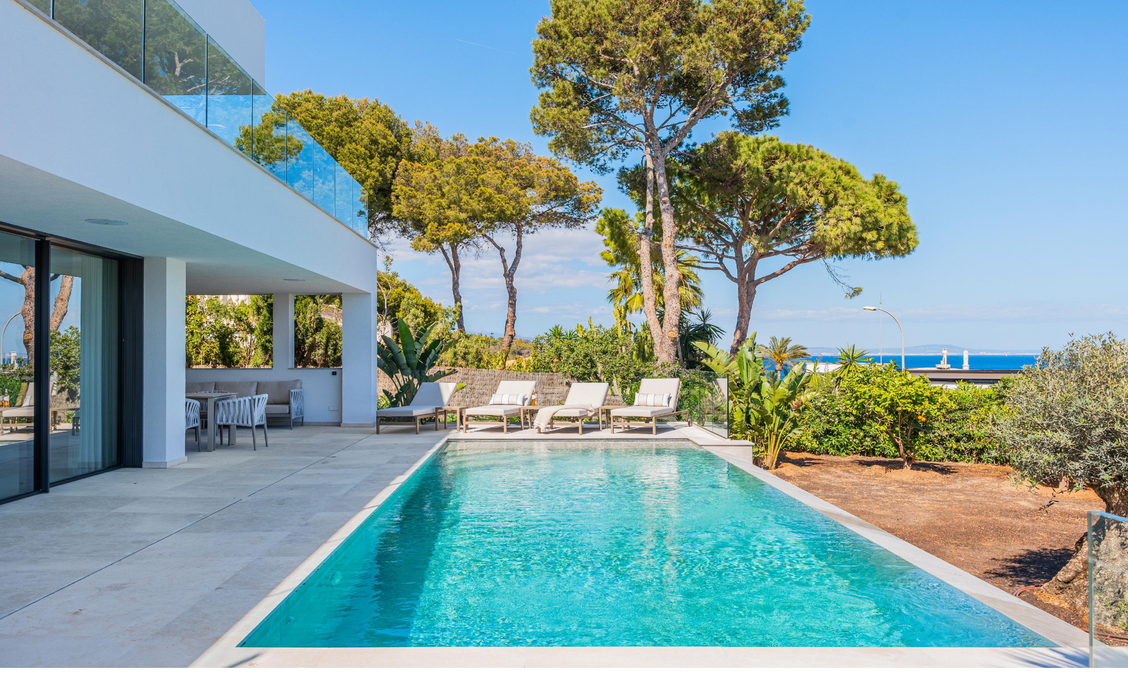
Timeless villa with sea views in Sol de Mallorca Sol de Mallorca - Mallorca - Balearic Islands