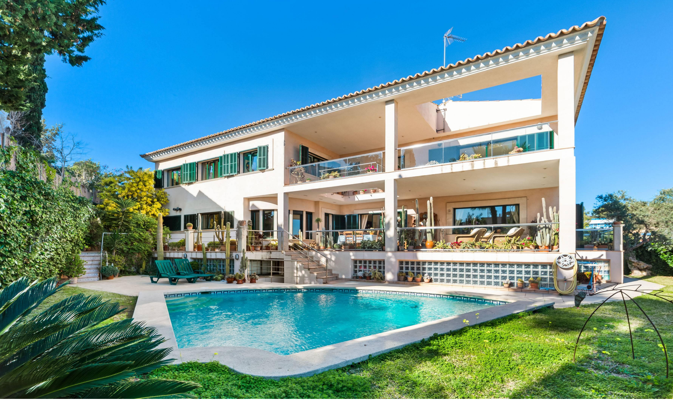
Villa with city views in Son Dureta