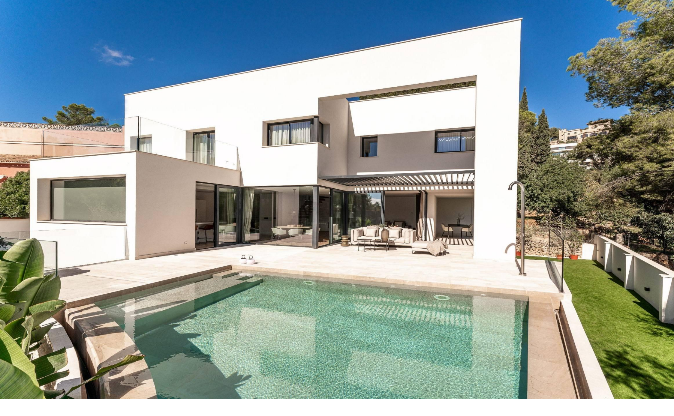
Beautiful newly built villa in Son Puig