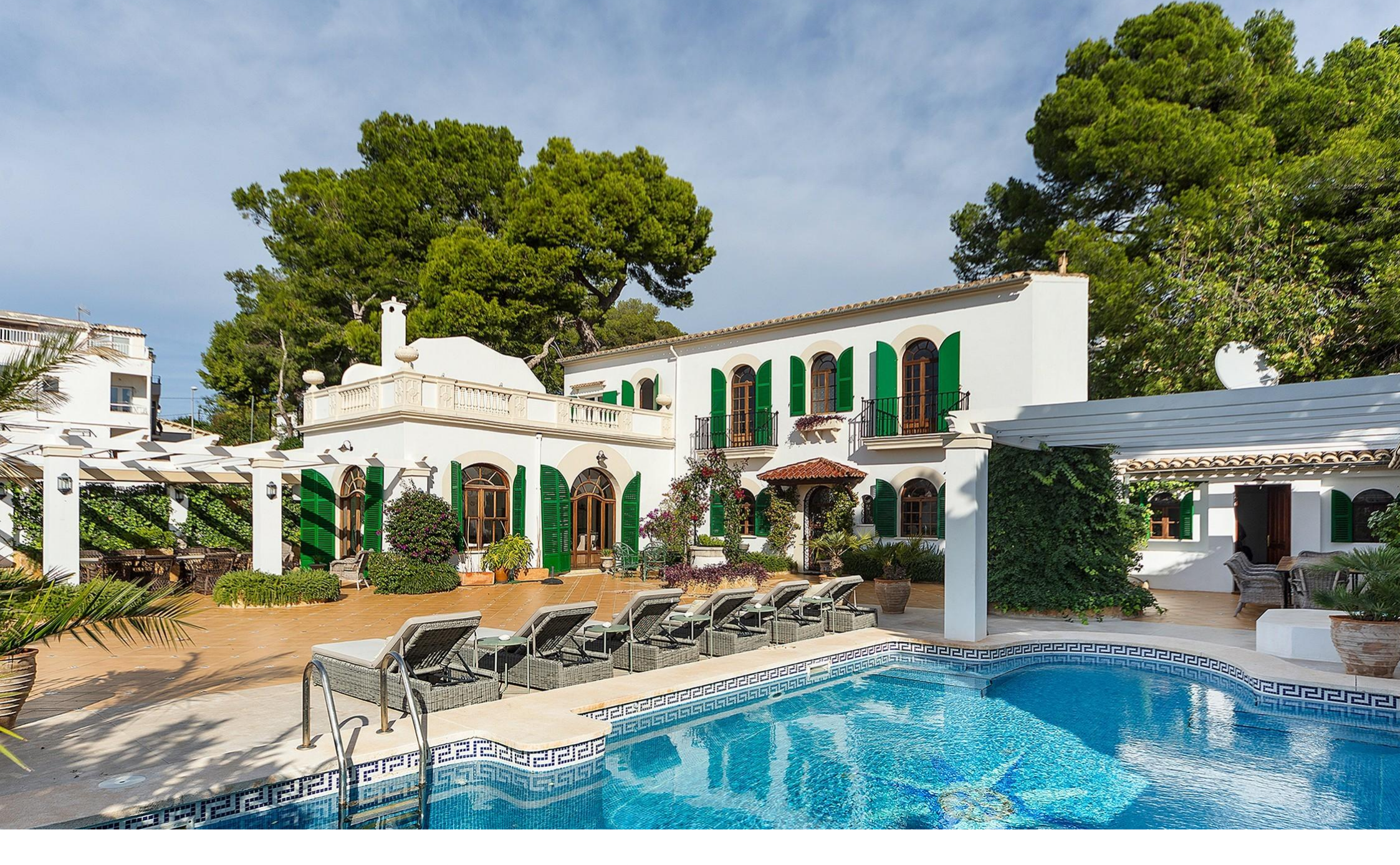
Reformed Mallorcan house with sea views in Cala Mayor