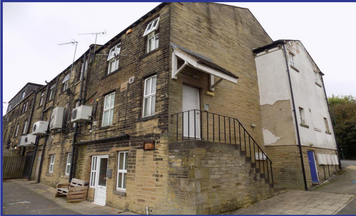
Flat 1, 310A Harrogate Road, Bradford, BD2 3TB