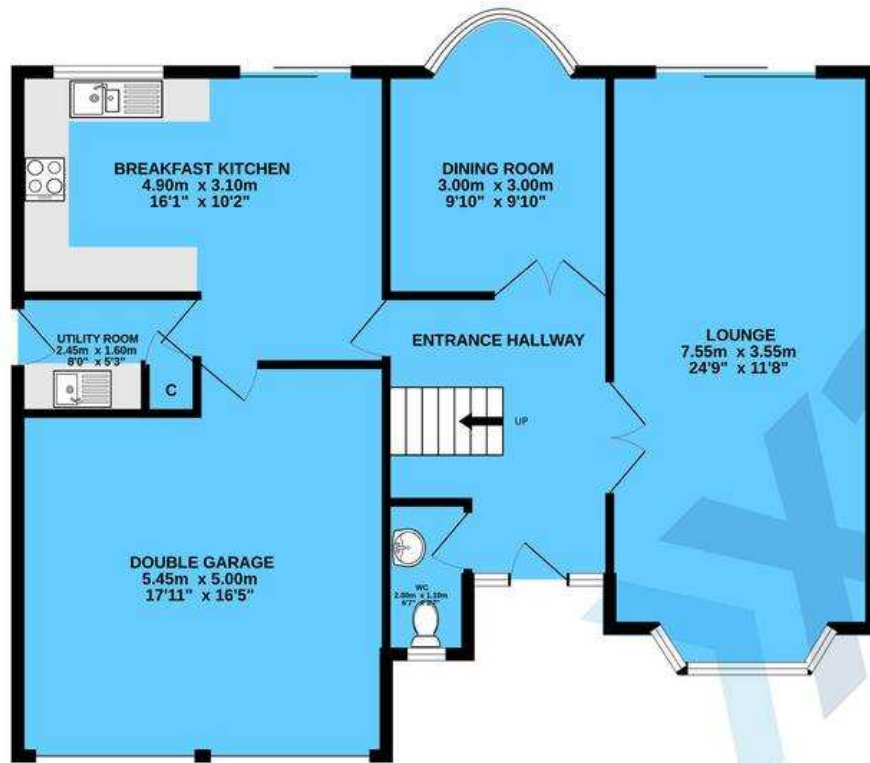
GROUND FLOOR 97.3 sq.m. (1047 sq.ft.) approx.