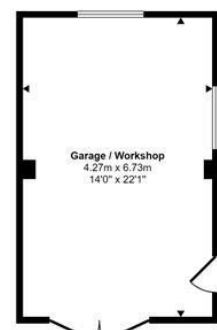
Garage / Workshop Approx 29 sq m / 310 sq ft

This floorplan is only for illustrative purposes and is not to scale. Measurements of rooms, doors, windows, and any items are approximate and no responsibility is taken for any error, omission or mis-statement. Icons of items such as bathroom suites are representations only and may not look like the real items. Made with Made Snappy 300.