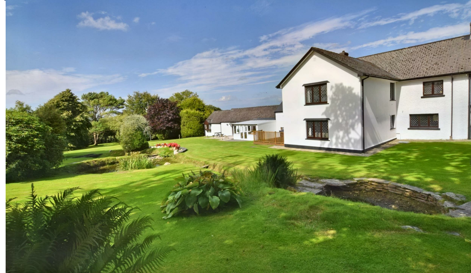
Castellan House, Blaenffos, Boncath, Pembrokeshire, SA37 0HZ

WE WOULD LIKE TO POINT OUT THAT OUR PHOTOGRAPHS ARE TAKEN WITH A DIGITAL CAMERA WITH A WIDE ANGLE LENS. These particulars have been prepared in all good faith to give a fair overall view of the property. If there is any point which is of specific importance to you, please check with us first, particularly if travelling some distance to view the property. We would like to point out that the following items are excluded from the sale of the property: Fitted carpets, curtains and blinds, curtain rods and poles, light fittings, sheds, greenhouses - unless specifically specified in the sales particulars. Nothing in these particulars shall be deemed to be a statement that the property is in good structural condition or otherwise. Services, appliances and equipment referred to in the sales details have not been tested, and no warranty can therefore be given. Purchasers should satisfy themselves on such matters prior to purchase. Any areas, measurements or distances are given as a guide only and are not precise. Room sizes should not be relied upon for carpets and furnishings.