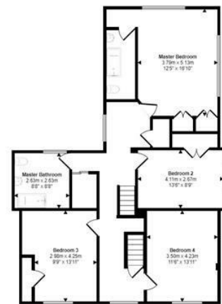
First Floor Approx 100 sq.m (1070 sq.ft)