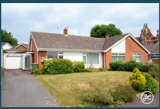
Mayfield Drive Bridgwater TA6 7JQ