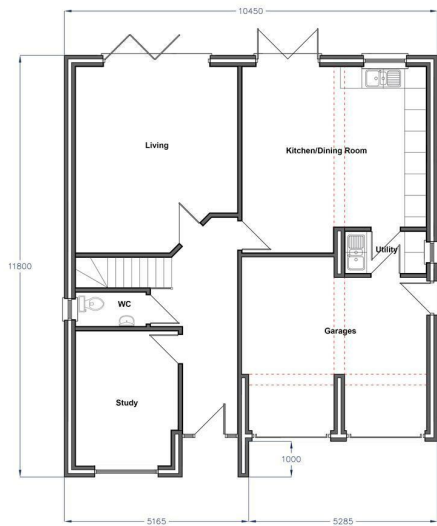
Ground Floor Plan (1:50 Metric Scale)