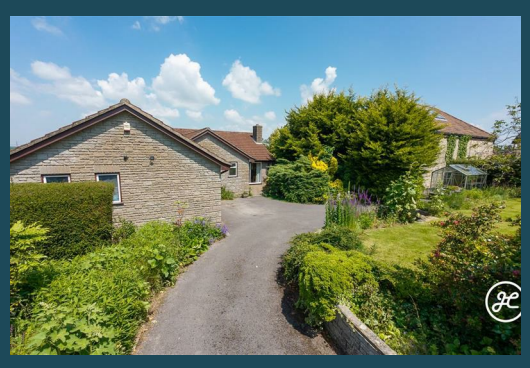
The Drive Woolavington Bridgwater TA7 8EJ