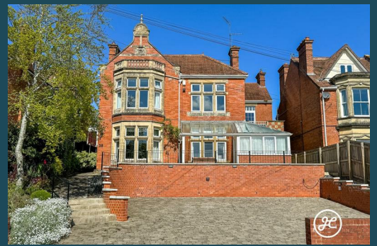
Durleigh Road Bridgwater TA6 7HU